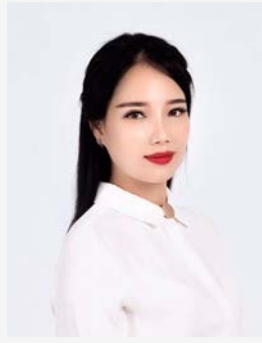
Alien Lin District Club Quality Chair