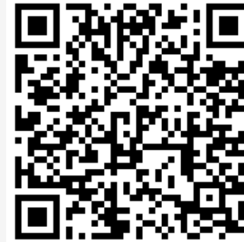
Club Success Plan