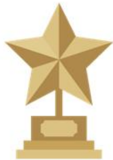
Table Topics Contest